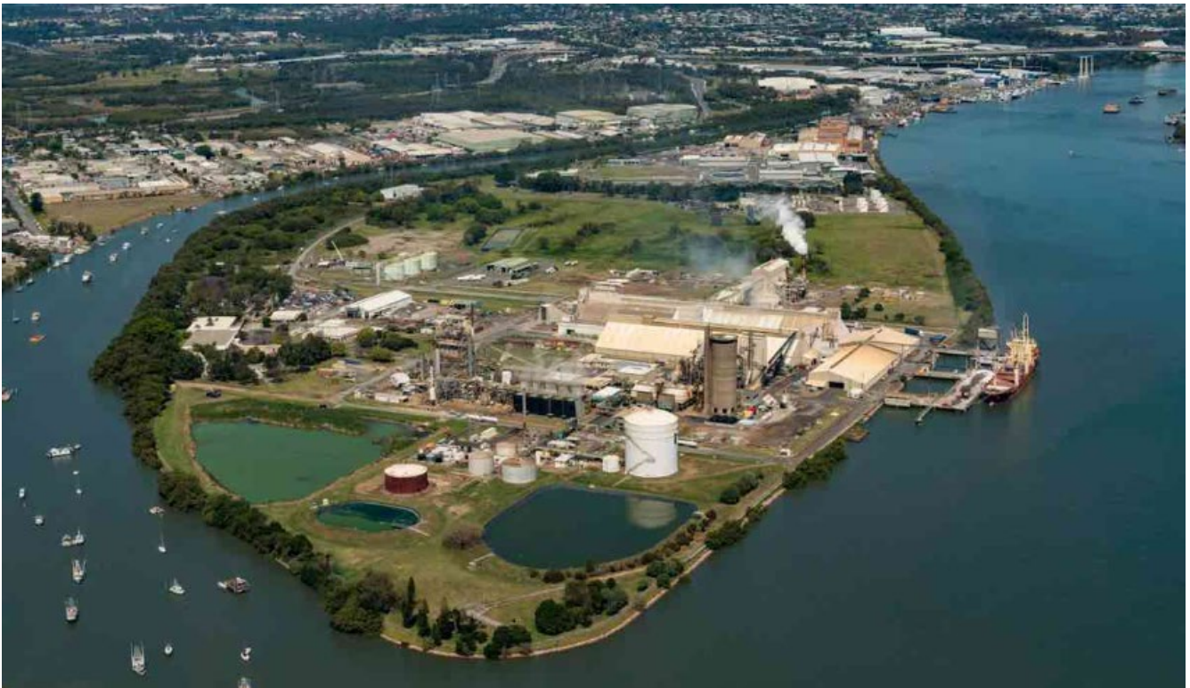
Figure 1 Gibson Island, Brisbane

Connection to Powerlink's transmission network by means of a network augmentation is required to allow electricity produced by renewable generation to power the proposed project.