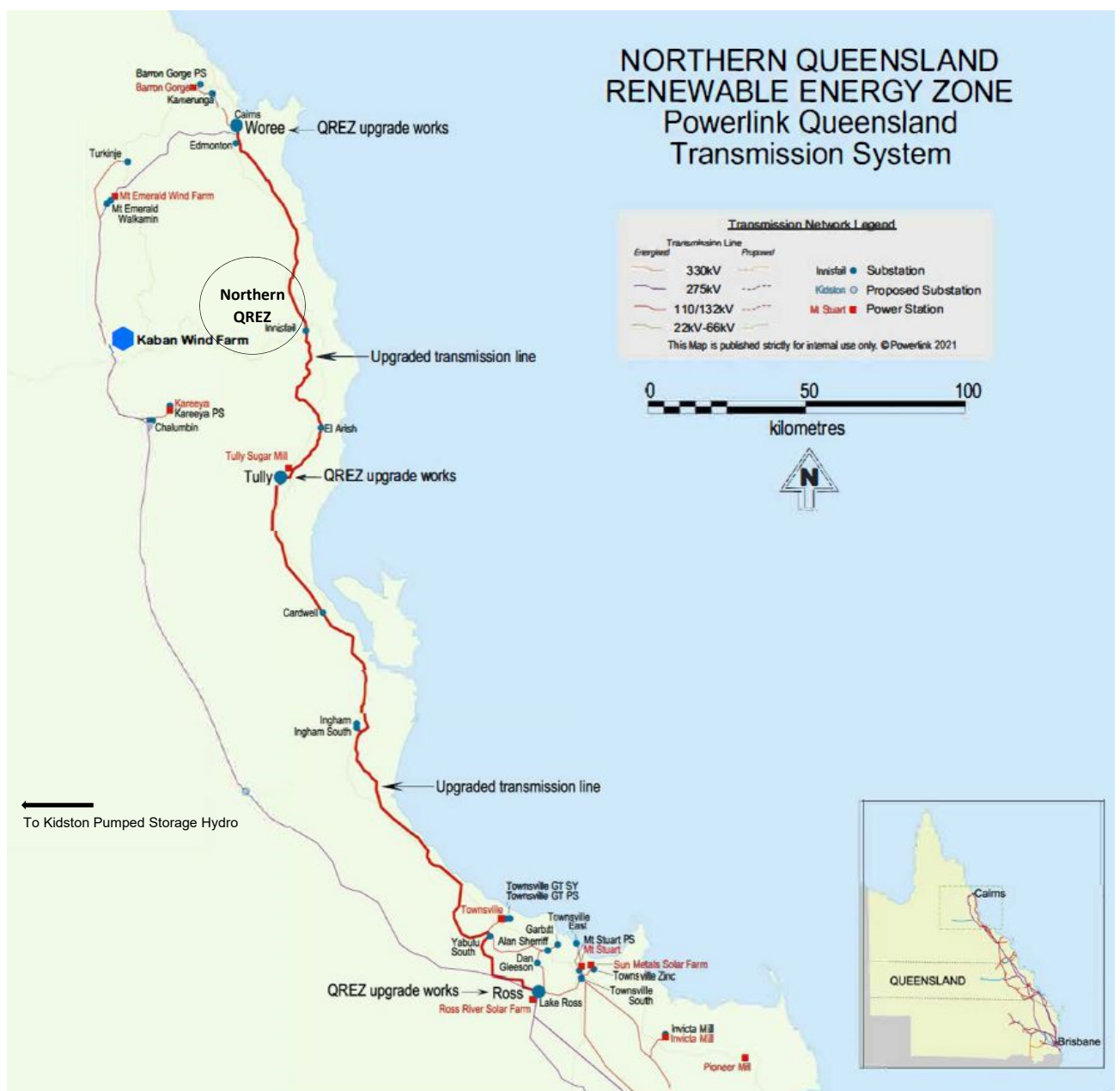
Figure 1 Northern Queensland Renewable Energy Zone

Without the 275kV upgrade, future VRE generators (post Kaban Wind Farm) will require additional investment in remediation to be compliant with Generator Performance Standards. In this context, the proposed capital expenditure has been assessed as prudent given that the benefits to the electricity market (as a whole) significantly exceed the cost of the capital works that Powerlink is required to undertake as part of this upgrade. Further, the market benefits associated with reduced network losses and improved reliability of supply to Cairns 8 are expected to result in additional benefits. Collectively, these will deliver positive long term benefits to electricity consumers.