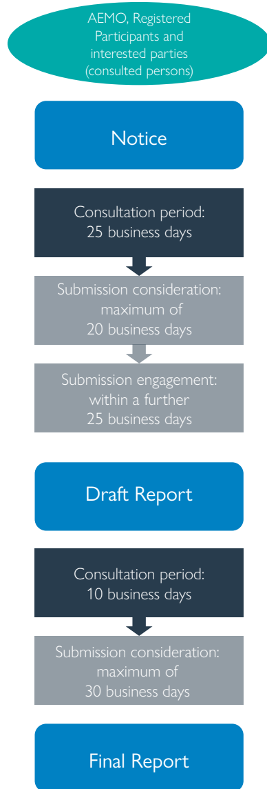
Figure A1: Funded augmentation consultation process