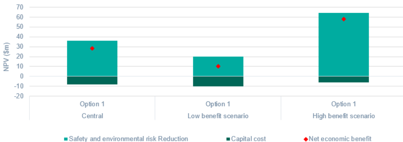
Figure 2 Net economic benefits, present value with ALARP applied ($m 2020/21)

Using the ALARP principle, where disproportionality factors have been applied on the bushfire and safety risks, the disproportionate benefits from the risk reduction outweigh the costs under all scenarios. This is shown in Figure 2. It is noted that, in accordance with the ALARP principle, the disproportionality factors have been selected to a level just below where the community, government and law would consider risk reduction expenditure to be grossly disproportionate.